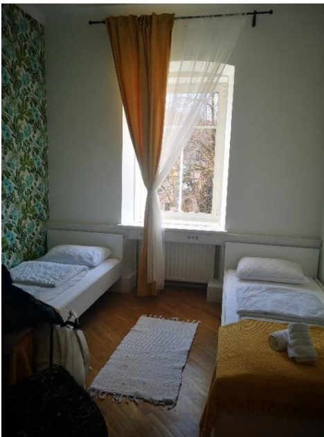
That's the hotel.

The worst that happened was that I had 88% of the subject, and I had to re-take to exam because it was noted as 5,0. There is an exam that is only 10%, and you need 5% to pass the course. Although I did a lot for the course, and I have problems with multiple-choice questions, I was struggling with achieving 20 points from 40. It was not possible to get the course done without this small part. During the stay, I also traveled with my friend by Flixbus. We have been to Swiss, Bosnia-Herzegovina, and Serbia. It was safe and not expensive. To Swiss, we took a bus at night, we have spent the whole day in the city, and we took the bus back during the night! That's a good idea to avoid expensive accommodation. In the end, it was also possible to go camping in Pula in Croatia! Very beautiful seaside, with a cave to swim in. Don't forget to have some money with you because while traveling to those countries, there are different currencies, and sometimes cash is really necessary there. I do not have any bad memories of Ljubljana. It was very sad to leave this city in the end.