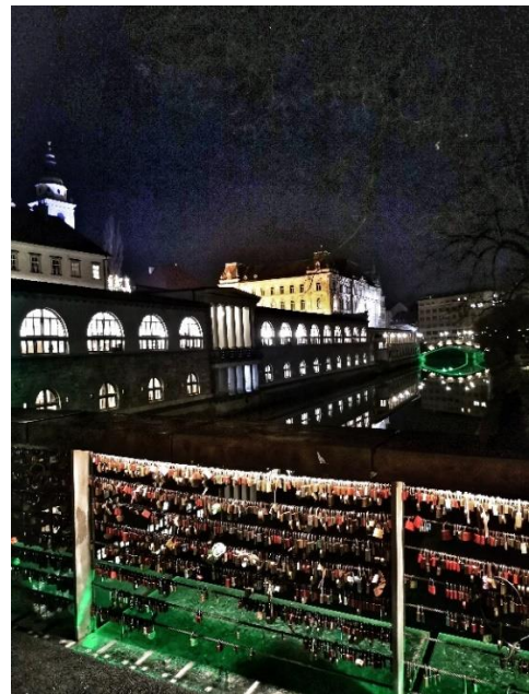
Ljubljana river at night.